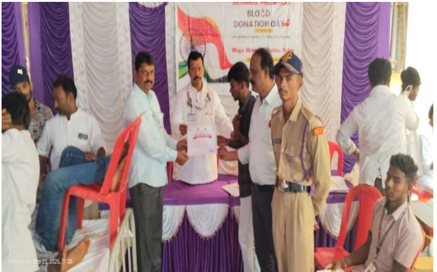
Masineri's, Sep 22, 2025, 11:38