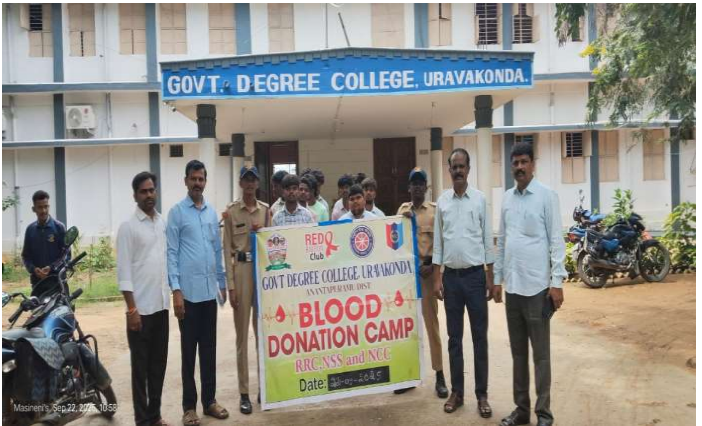
Masineri's, Sep 22, 2025, 10:58