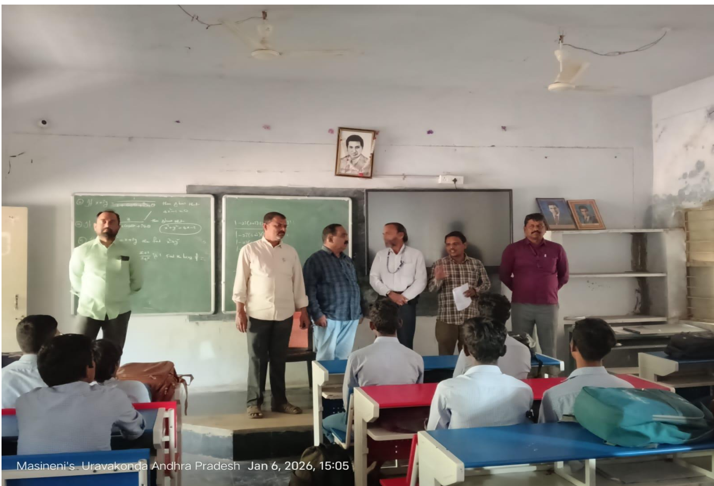
Masineni's Urvakonda Andhra Pradesh Jan 6, 2026, 15:05